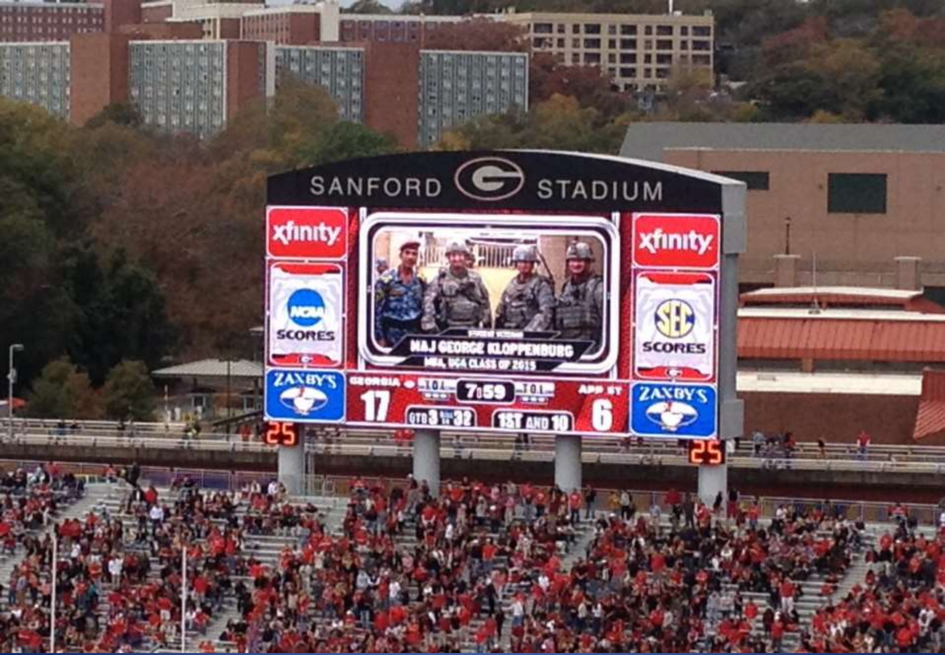
USG: PROUDLY SERVING OUR MILITARY, VETERANS & THEIR FAMILIES